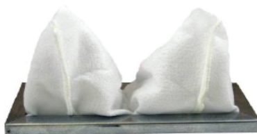
Oil Mist Bag Filter

CAUTION: It is important to keep the filters clean, to let the exhaust system do its job.