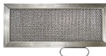
(2) Metal Mesh Filters